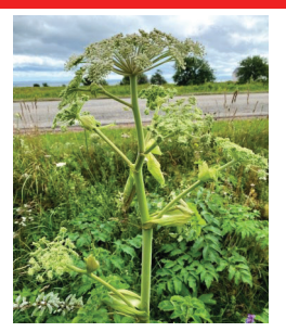
Woodland Angelica (Angelica sylvestris)

These two invasive species are present in PEI (respectively: rare and widespread) and can be found along roadsides. They have phototoxic sap which can result in bodily harm when exposed to skin. Avoid handling or stepping on their stems (this exposes the sap) and make sure you are equipped with the following personal protective gear: