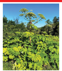
Giant Hogweed (Heracleum mantegazzianum)

As we are aware it has not yet established on PEI (spring 2022). Flowers bloom from May - September, can grow 1-5ft tall.